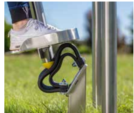
The circle inside ensures stability and a soft absorption.