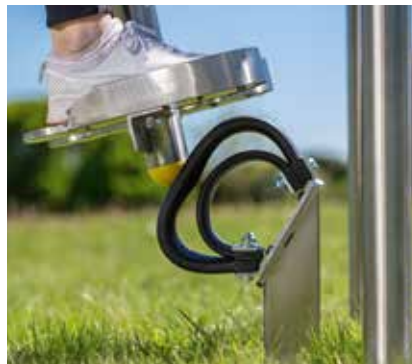
Slowing down the impact of the seesaw by the outer circle.