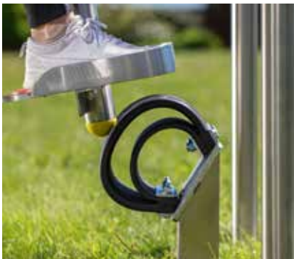
Operating mode of 2-phase shock absorption:

The Terrasoft seesaw softener can also be mounted directly on the seesaw frame as a shock-absorbing element.