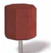
with Floor anchor Item no. 2565000109

The Terrasoft polygon is used in numerous areas: for example as a boundary element for entrances and paths or as seating, for example on sandpits. Different colours encourage children to play imaginatively. For even more design variations, the polygon is also available in EPDM colours.