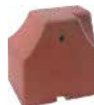
Hockey board corner element Item no. 255000xx2

The Terrasoft hockey board is the edging element for street-hockey pitches and skate facilities, because it is also suitable for ice hockey and skating rinks, since the playing surfaces can be flooded from -10 ° C. It is often used on skate parks or in inner-city areas for the temporary installation of a street-hockey field.