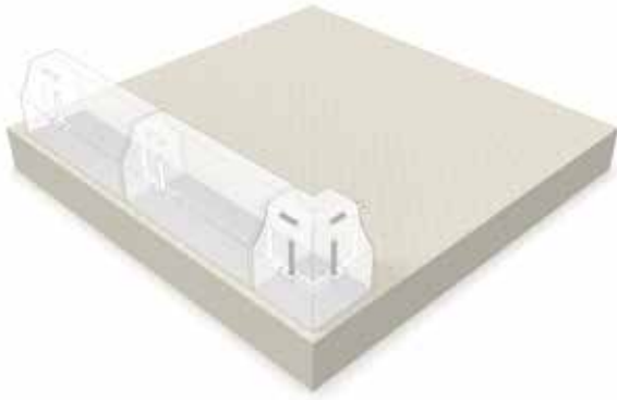
Positioning the hockey board. Connecting the elements on the underside using the assembly set.