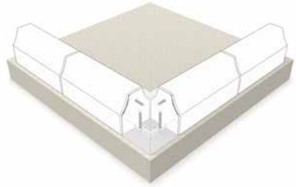
Positioning the hockey board with the aid of the corner element.