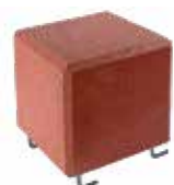
with Floor anchor Item no. 256500109

The Terrasoft cube finds a use in numerous areas: whether as a border element for driveways and paths or as a seat, for example, near sandboxes. It can also be used in riding halls or stable alleys. A particularly impressive game feature is the cube as a climbing pyramid. Different colours stimulate imaginative play of the children. For even more design variations, the cube is also available in EPDM colours.