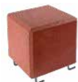
with Floor anchor Item no. 256500109

The Terrasoft cube finds a use in numerous areas: whether as a border element for driveways and paths or as a seat, for example, near sandboxes. It can also be used in riding halls or stable alleys. A particularly impressive game feature is the cube as a climbing pyramid. Different colours stimulate imaginative play of the children. For even more design variations, the cube is also available in EPDM colours.