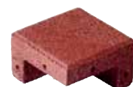
Corner element 150 x 150 x 85 mm Item no. 251030xx1

Angle and corner covers serve as external optical finishing of terraces and balcony coverings as well as wall coverings in the vicinity of playground equipment. For outdoor use.